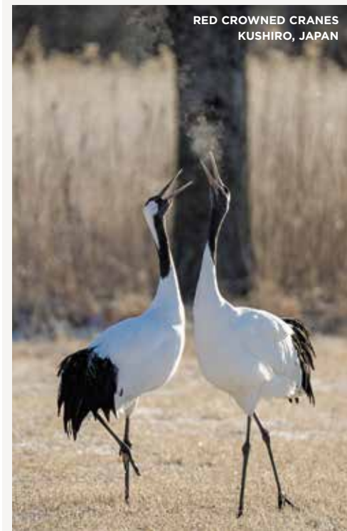
RED CROWNED CRANES KUSHIRO, JAPAN

SUITE CATEGORY WAS NOW VERANDA from ..... 12 939€ pp 10 351€ pp