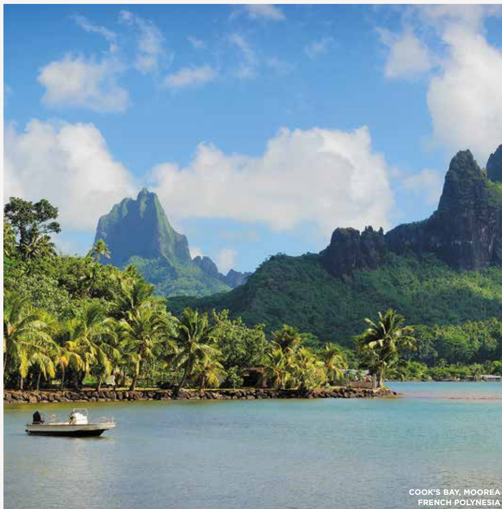
COOK'S BAY, MOOREA FRENCH POLYNESIA

SUITE CATEGORY WAS NOW DELUXE VERANDA from..... 7 159€ pp 5 369€ pp