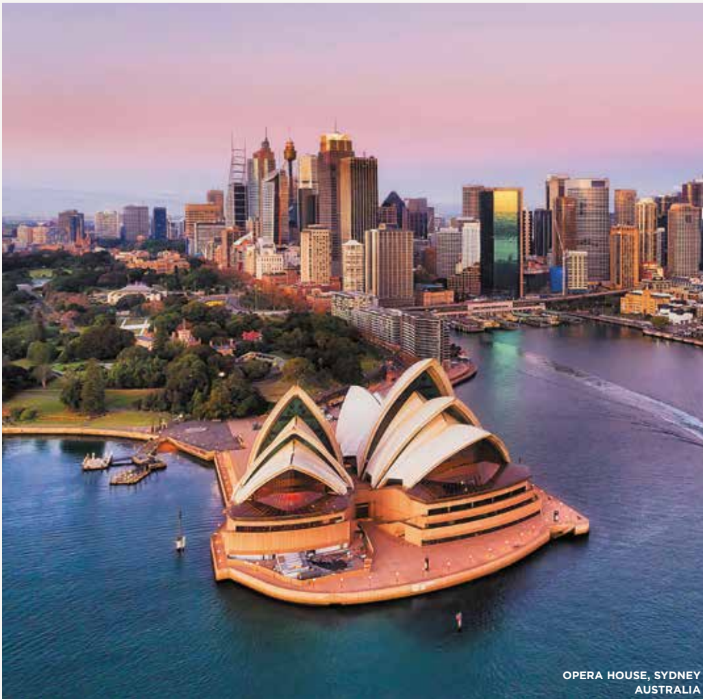
OPERA HOUSE, SYDNEY AUSTRALIA

For more Included & Unlimited Shore Excursions call TMG.