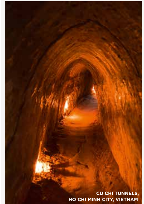
CU CHI TUNNELS, HO CHI MINH CITY, VIETNAM

SUITE CATEGORY WAS 9 983€ pp VERANDA from ..... 12 479€ pp 9 983€ pp