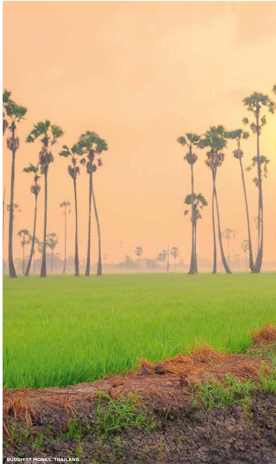
BUDDHIST MONKS, THAILAND

FOR MORE INFORMATION CONTACT TMG / SEAGNATURE.COM +377 97 98 41 31