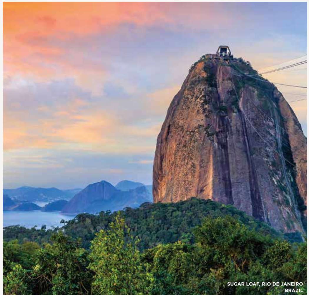
SUGAR LOAF, RIO DE JANEIRO BRAZIL

SUITE CATEGORY WAS NOW DELUXE VERANDA from..... 8 539€ pp 5 977€ pp